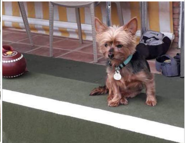
Tinker ready to round up any stray bowls.